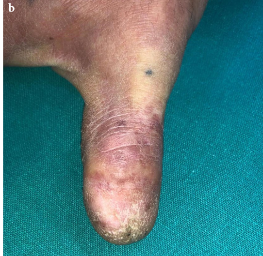
Fig. 1. (a) Thumb at diagnosis, (b) thumb after 4 years.