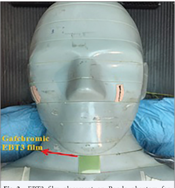
Fig. 3. EBT3 film placement on Rando phantom for measurement.

Before measurements, a calibration curve was created for the film batch. The films cut into 2.5 \times 2.5 cm<sup>2</sup> and placed perpendicularly between the water equivalent slab phantoms at the depth where the linac calibrated 1