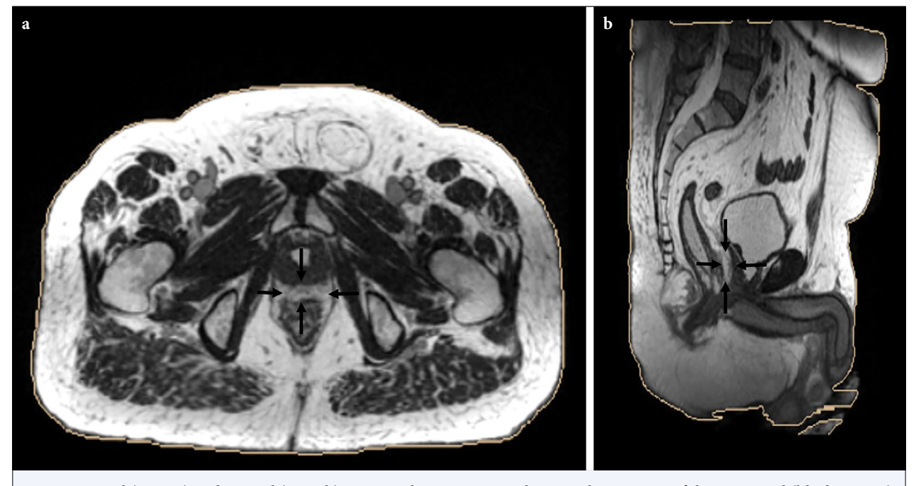
Fig. 2. Axial (Fig. 2a) and sagittal (Fig. 2b) MR simulation imaging showing the position of the spacer gel (black arrows) between the rectum and the prostate.

The patient signed an informed consent describing in detail the chosen therapeutic approach and gave consent for the use of data for this research.