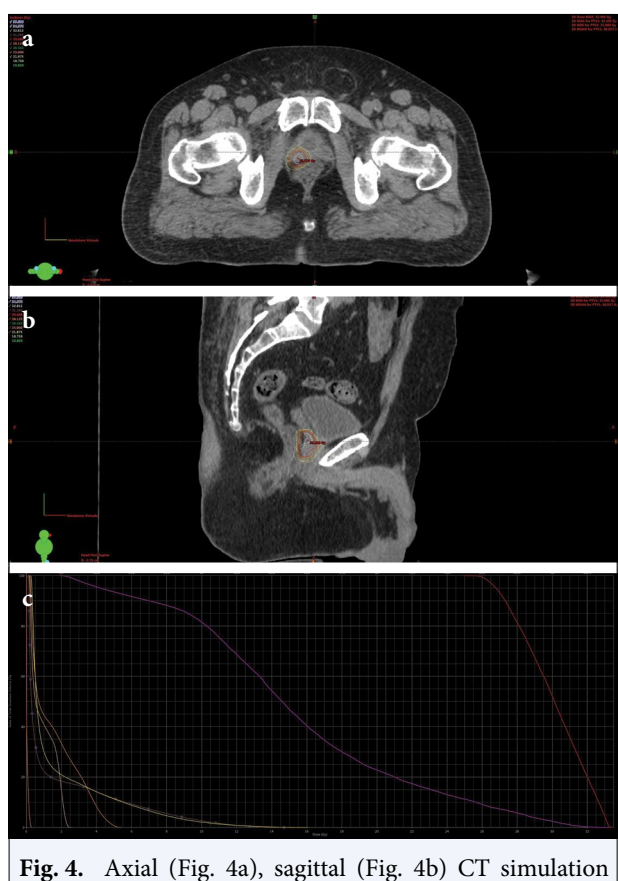
Fig. 4. Axial (Fig. 4a), sagittal (Fig. 4b) CT simulation images, and dose-volume histogram (Fig. 3c) of the SBRT plan.

We used a hydrogel rectum spacer to perform salvage SBRT in a patient with radio-recurrent prostate cancer and UC. Our patient was not on pharmacologic therapy and, as such, had a favorable prognosis with regards to toxicity stemming from RT.[12] Several studies report the feasibility of hydrogel rectal spacers in patients receiving primary radiation for prostate cancer.[13-18] A recent UC patient case report demonstrated the successful treatment with Ir-192 brachytherapy for primary PC, after SpaceOAR gel injection. The patient reported no bowel issues following HDR brachytherapy after one day, one week and five months, respectively.[19]