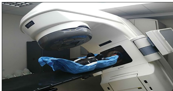
Fig. 1. The irradiation of Alderson Rando phantom in Varian DHX (Rapidarc) linear accelerator.

The phantom used in this study had no limbs and represented a 155 cm in length woman with breast tissue (Fig. 1). The breast tissue doses that occurred about 40 cm away from the center of the cervical tumor created virtually on the phantom were measured and evaluated. The original cross-sections of the phantom were used as the breast sections. The two parts of the upper sections of the breasts were removed. The TLDs placed in the breast sections are shown in Figure 2.