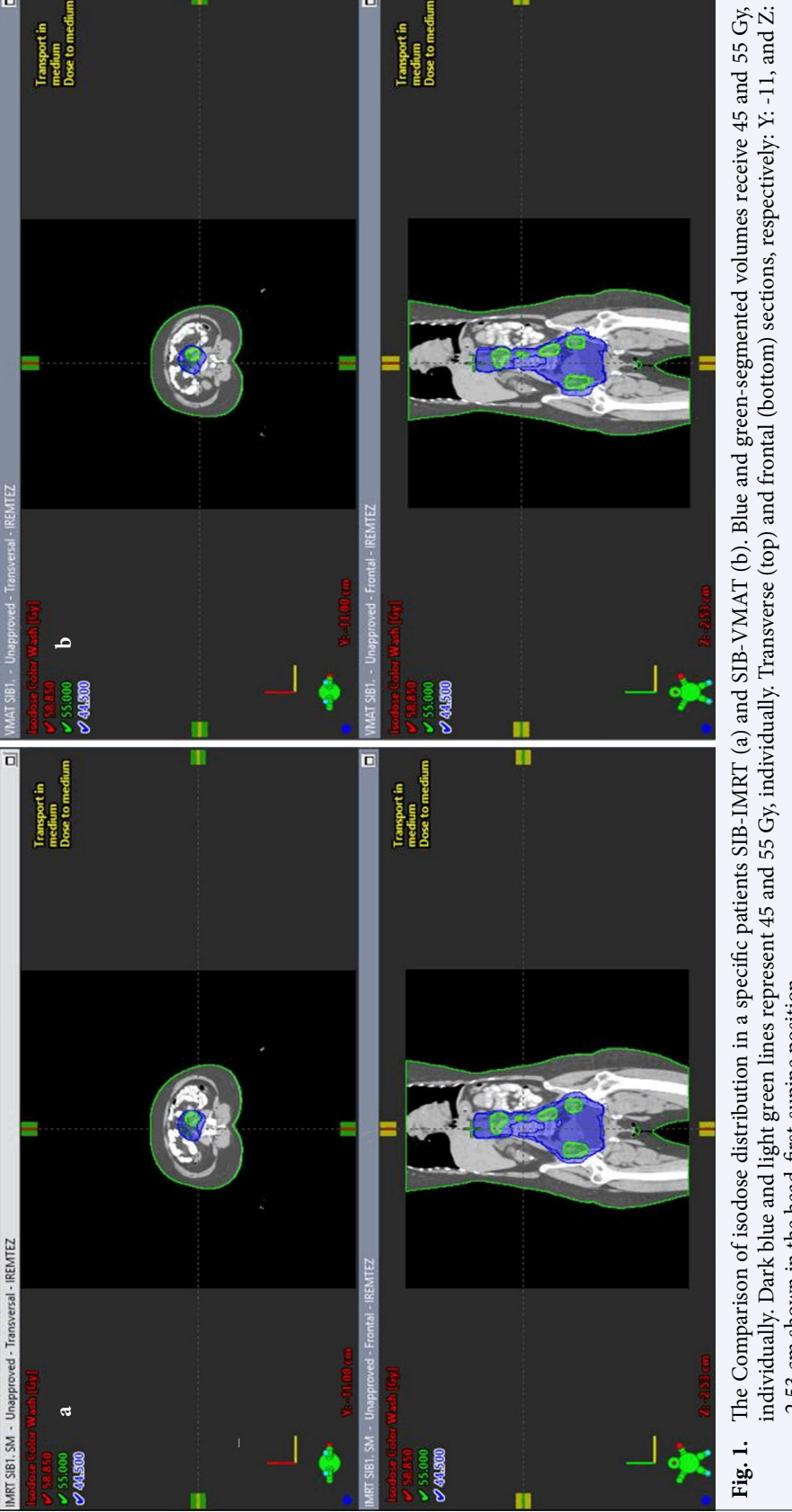
SIB-IMRT: Simultaneous Integrated Boost-Intensity Modulated Radiation Therapy; SIB-VMAT: Simultaneous Integrated Boost-Volumetric Modulated Arc Therapy. -2.53 cm shown in the head-first-supine position.