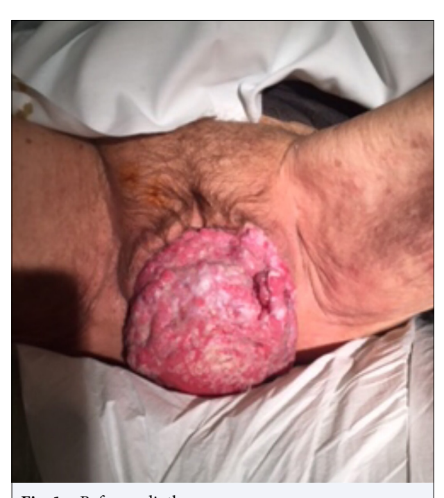
Fig. 1. Before radiotherapy.

An 89-year-old, gravida seven, parity four, with vaginal delivery and hypertension, presented with vaginal bleeding and uterine prolapse. She had been suffering from UP for 10 years. A vegetative 10×10 cm ulcerated, bleeding tumoral lesion filled the anterior surface of the irreducible prolapsed uterus (Fig. 1). Cervical biopsy revealed micro-invasive squamous cell carcinoma of the cervix, p63 positive, pan-cyto-keratin positive, Ki-67 focal positive. In thoracic and abdominal computed tomography, nonspecific solitary nodules, a 24 mm hypodense lesion in the liver (metastasis?), voluminous uterus, lymphadenopathies 14×12