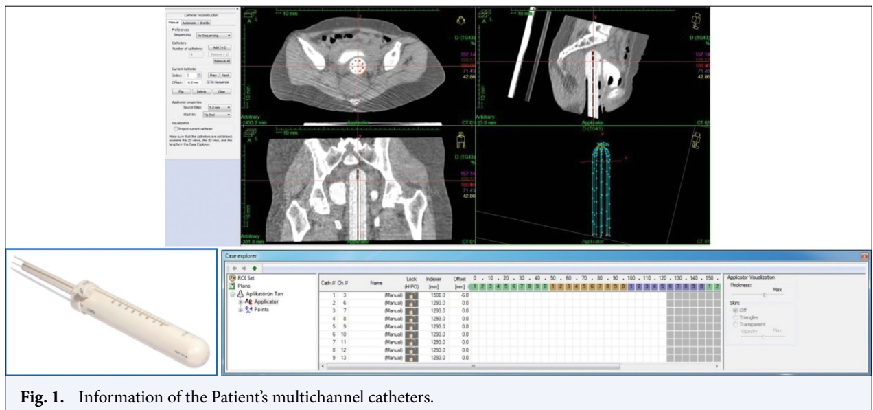
Fig. 1. Information of the Patient's multichannel catheters.

11. Quality control: Generally, multichannel cylinder brachytherapy applicator is used as an applicator in the gynecological brachytherapy applications. After each use of these applicators, it is necessary to sterilize and preserve their sterilization until application. Place-