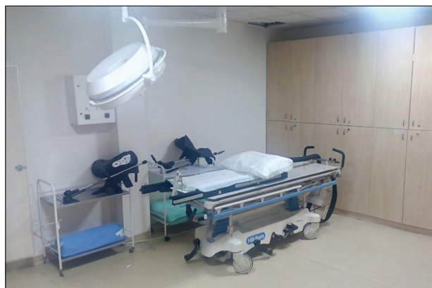
Fig. 4. Patient transfer and treatment table systems (DI-ACOR Zephyr HDR) in the brachytherapy application room.

ning information data are taken through a printer for reporting and control. All stages of the treatment plan approved here are checked with print data. This set of data is a summary of the accepted treatment plan and shows all stages. Print data contain the following parts: Patient Information, Treatment Unit, Calibration Data, Treatment Data, Dose Normalization, Optimization and Prescription, Source Positions, Catheter (channel) Times, Total Treatment Time, Source Coordinates and Times, Applicator Points. Our patient plan sent to the treatment device is uploaded to the system and checked with print data. Here, the patient information and all the catheters of multichannel that are actively filled during the planning are checked. For the fraction, dose and total treatment time are checked by comparing the print data and the pre-treatment report. After the CT scan, the patient is transferred to the treatment device for treating, and then the cylinder orientation is checked after the applicator's catheters are connected to the treatment device. After print data and the treatment device have been checked, patient treatment is initiated, and the patient treatment is completed while the patient is followed up with camera systems.