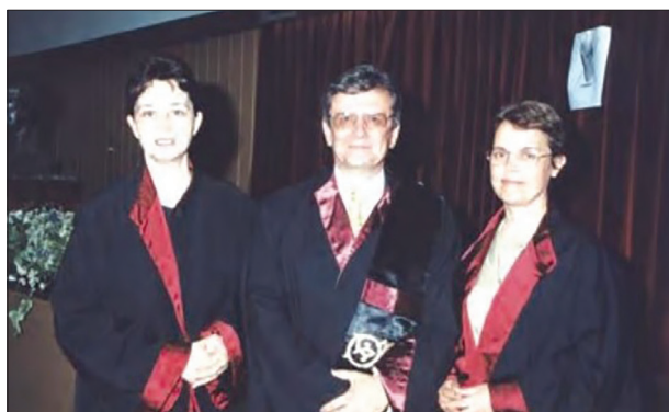
Fig. 2. At gowning ceremony after being an associate professor (1998).