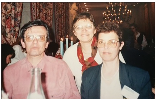
Fig. 1. A GEC-ESTRO annual meeting held in Naples, Italy.

Ismail also had an active role in the research project "Introduction of dosimetry and application methods of